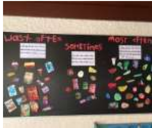
LEAST, SOMETIMES, MOST OFTEN

You may have seen this bulletin board greet you as you walk into our school. We like our displays to reflect the conversations we are having with our students as well as reflect what we value as a school community. For those of you who haven't seen this, here are the children's words, accompanying their pictures.